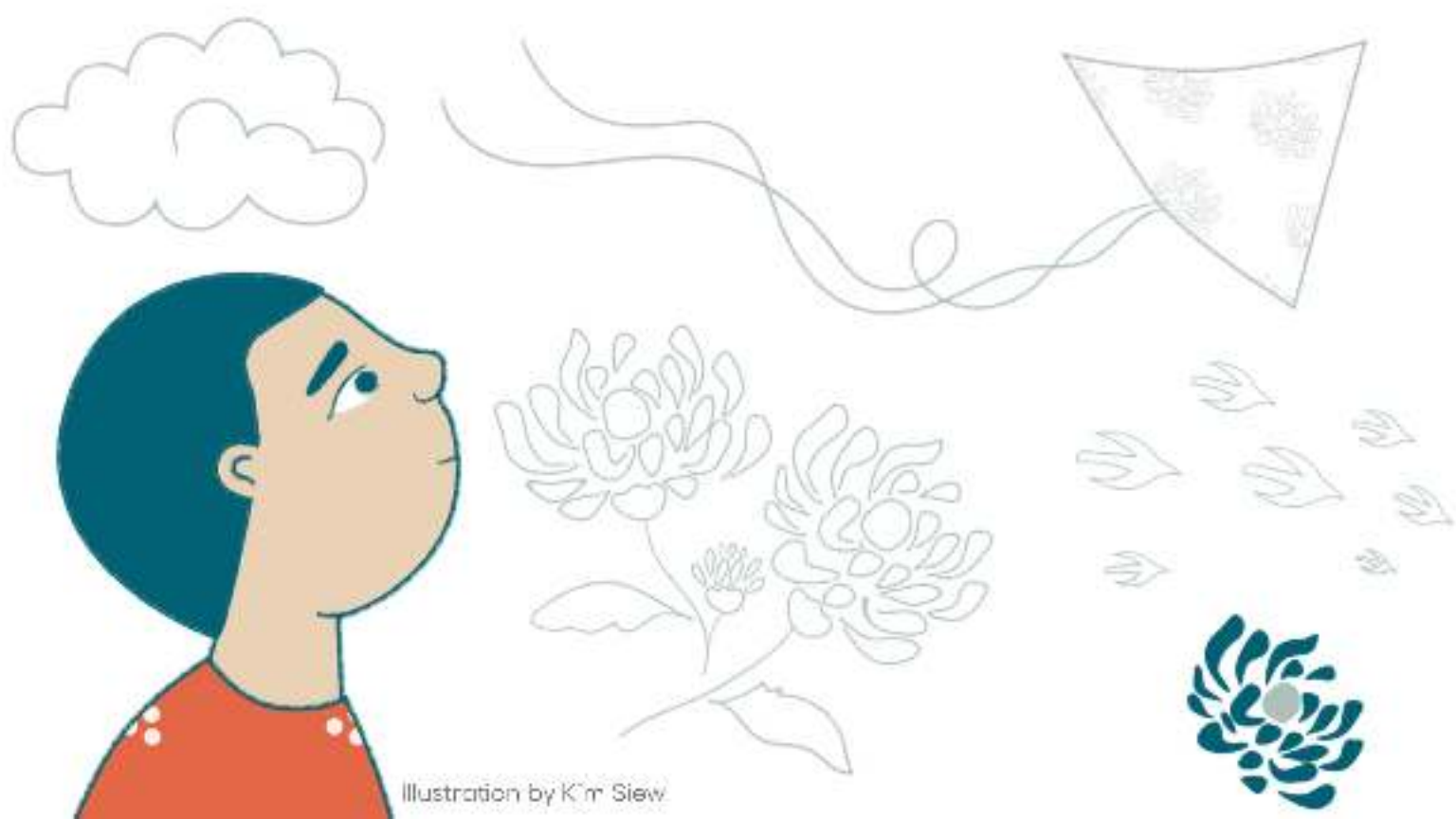
Illustration by Kim Siew